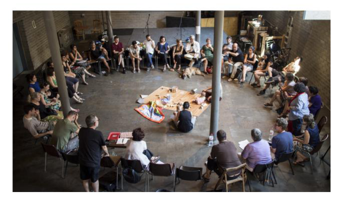
Figure 3: La Borda's general assembly

Although some contradictions and limitations should be mentioned, like the (yet) unstable legal framework, the limited access to financing and the significant amount of monthly contribution that every member has to pay ( \notin 450 for the average wage), the whole Can Battló area case shows us that in times of economic and housing crisis local collective actors such as neighborhood initiatives, urban movements and organizations can take action in the Lefebvrian concept of right to the city re-using and re-appropriating vacant unused spaces with the goal of creating a common space for collective and mutual ways of living.