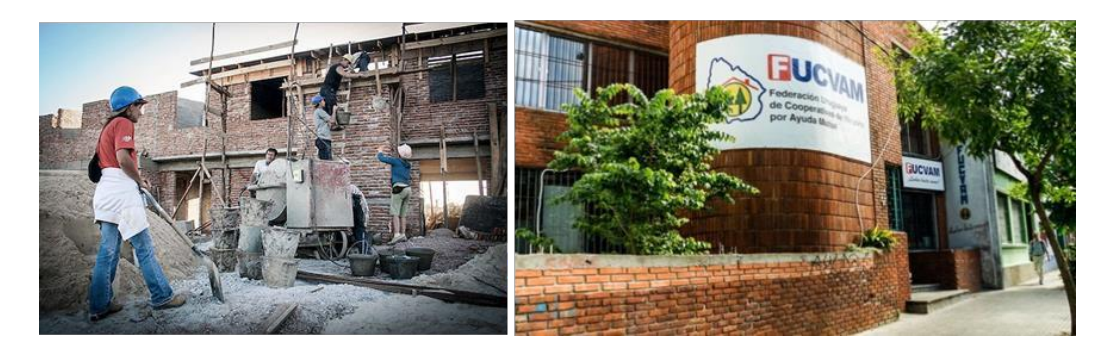
Figure 4: FUCVAM housing cooperative of mutual help in Uruguay

Latin America has a long history of housing policies as well as housing struggles. There is a long heritage of housing cooperative and collective building practices, but also a legal and institutional background in applying property law and ownership patterns. Therefore, when it comes to housing ownership, the law establishes two possibilities: user and owner. Ius utendi is the right to use it; ius fruendi is the right to earn from the products that come from the property; and the ius abutendi is the right to dispose of the property. All these synthesize a property law framework which can be described as the right to use, enjoy and dispose of it within the social function and normative limits (Valadares and Cunha 2018).